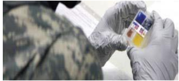
Assembled CRESS Kit in Use

The technology was transitioned to the Joint Program Manager for Contamination Avoidance.