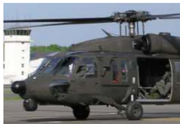
AN/ZSQ-2 3 rd Gen Demonstrator