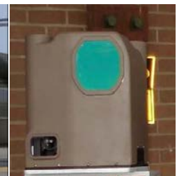
Mini LRAS3 Demonstrator